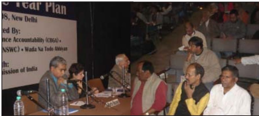
Role of Civil Society in the 11 th Five year Plan