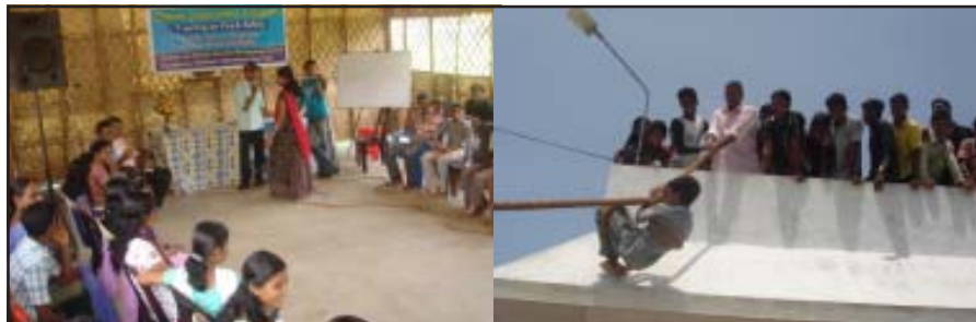
Training on Fire and Rescue Operation