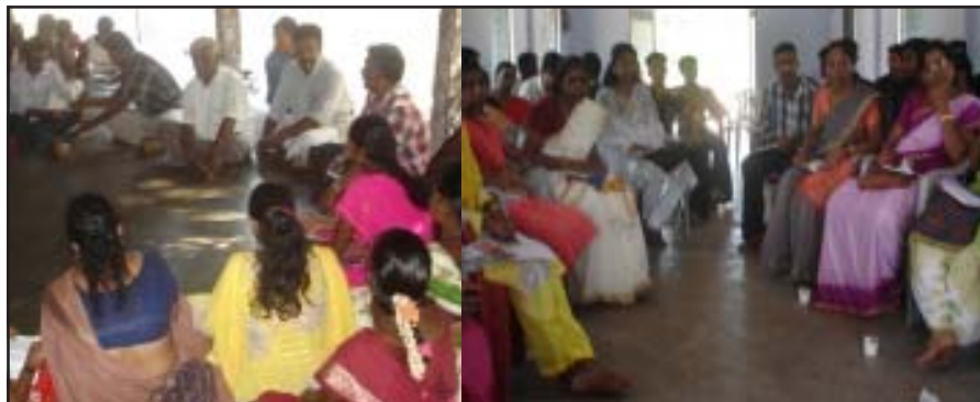
Exposure visit to Nagapattanam