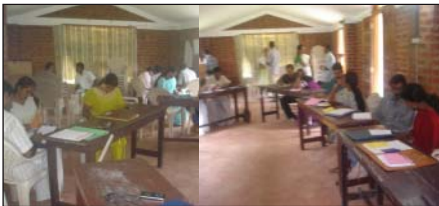
Participatory Training of Trainers Programme