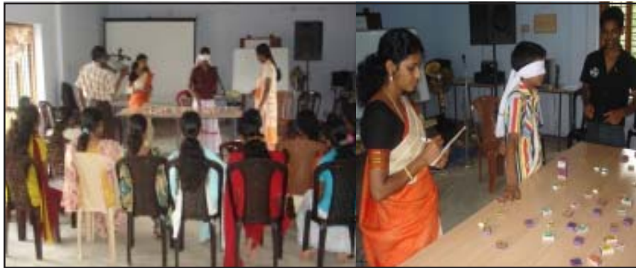
Leadership Communication Programme