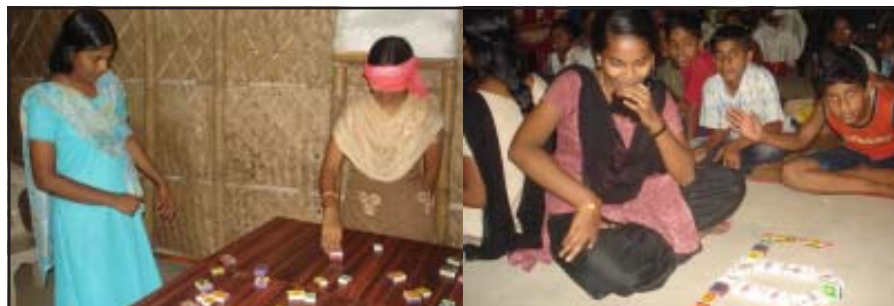
Leadership Training Activities