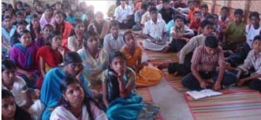
Community Living Camp