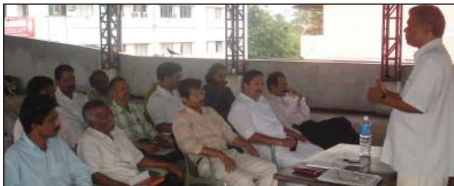
NREGA Awareness Building Classes

A total of 1830 citizens from 32 panchayats in 7 districts benefited from this programme. Consultancy services on Project identification, planning and development were also given to the functionaries of PRIs and leaders of Civil Society Organisations and citizen leaders of 32 Panchayats. Moreover, 10,000 citizens from all walks of life got benefited from the distribution of learning materials on NREGS.