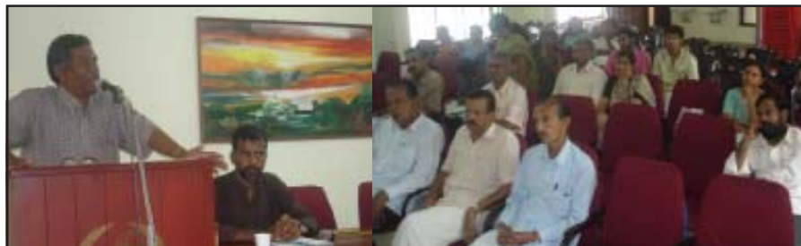
RTIA Orientation for KAVAL Members

Sahayi resource team also provided facilitation support for seminars/workshops and orientation organized by several government, non- government organizations and educational Institutions in the state on Panchayat Raj, RTIA, perspective planning, NREGS etc.