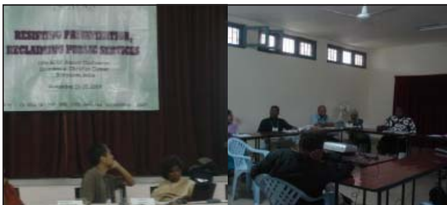
Resisting Privatization & Reclaiming Public Services, Bangalore India