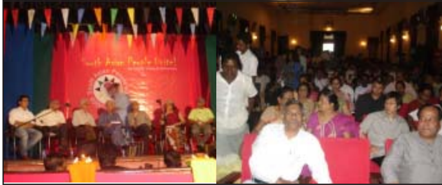
People SAARC Meet in Sri Lanka