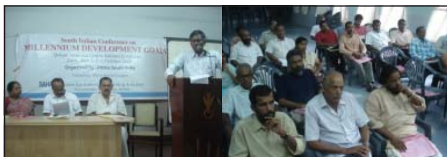
MDGs South Indian level 2 day workshop