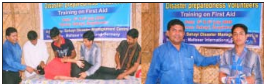
Training on First aid