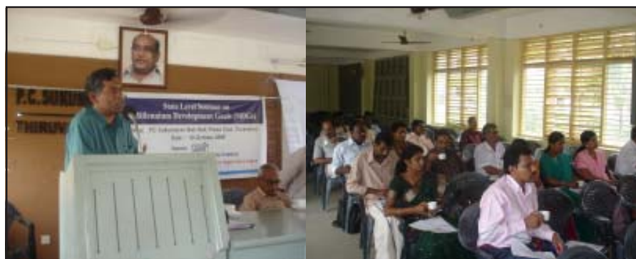
MDG State level workshop