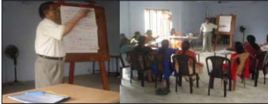
Entrepreneurs Development Programme