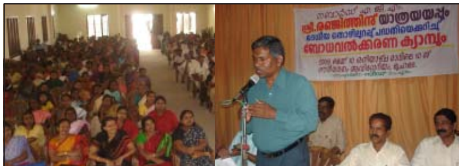
NREGA Orientation Seminar

To help enable the selected Panchayats to deliver Rural Employment under National Rural Employment Guarantee Scheme (NREGS) in Kerala, Sahayi organized some innovative interventions like mobilization of citizens for engaging them actively in all stages of the Scheme – registration, issue of job cards, identification of projects, project planning and development, applying for job, implementation of social audit, and owning the whole process through massive awareness on NREGS.