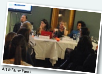
Art & Fame Panel

YPN events provide a forum where people can come together to both fundraise and find out more about One to One Children's Fund's groundbreaking work in Africa, Kosovo and the Middle East. By aligning charity with the chance to engage with topics outside one's career focus, such as the contemporary art scene, philanthropy can be seen as an exciting space where individuals from all walks of life and all sectors can have a meaningful impact on the world.