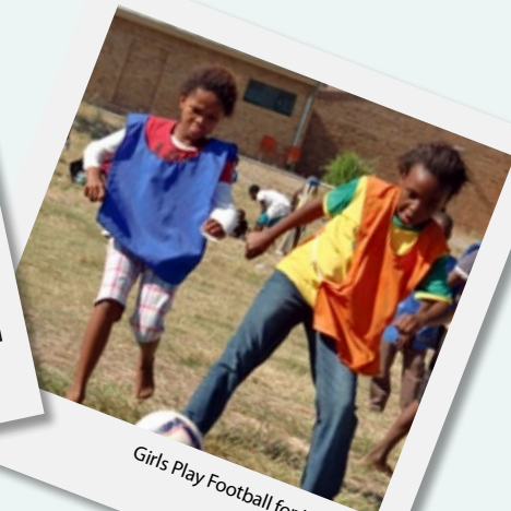
Girls Play Football for Life too!